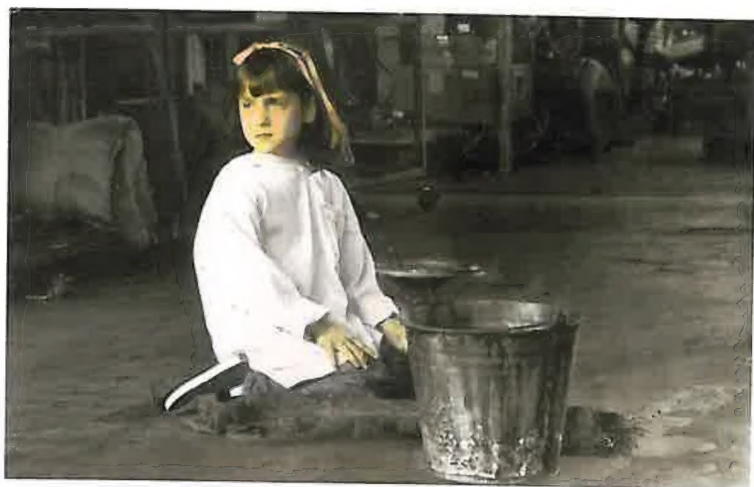
Mara Wilson as Matilda

Matilda starts school late. (Her parents forgot to send her.) Her teacher is Miss Honey, and she is the best teacher in the world. The head teacher is Miss Trunchbull. She is the worst teacher in the world and she hates children!