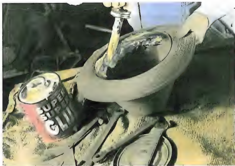
Matilda secretly took his hat and put a thin line of glue round the inside.

When he got home that evening his wife said, ‘Come here. I’ll take it off for you.’ And she pulled the hat hard.