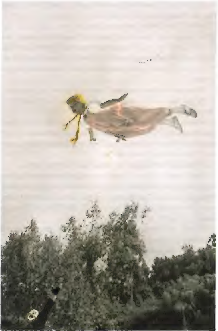
Miss Trunchbull stopped holding her hair and the girl flew up into the sky!