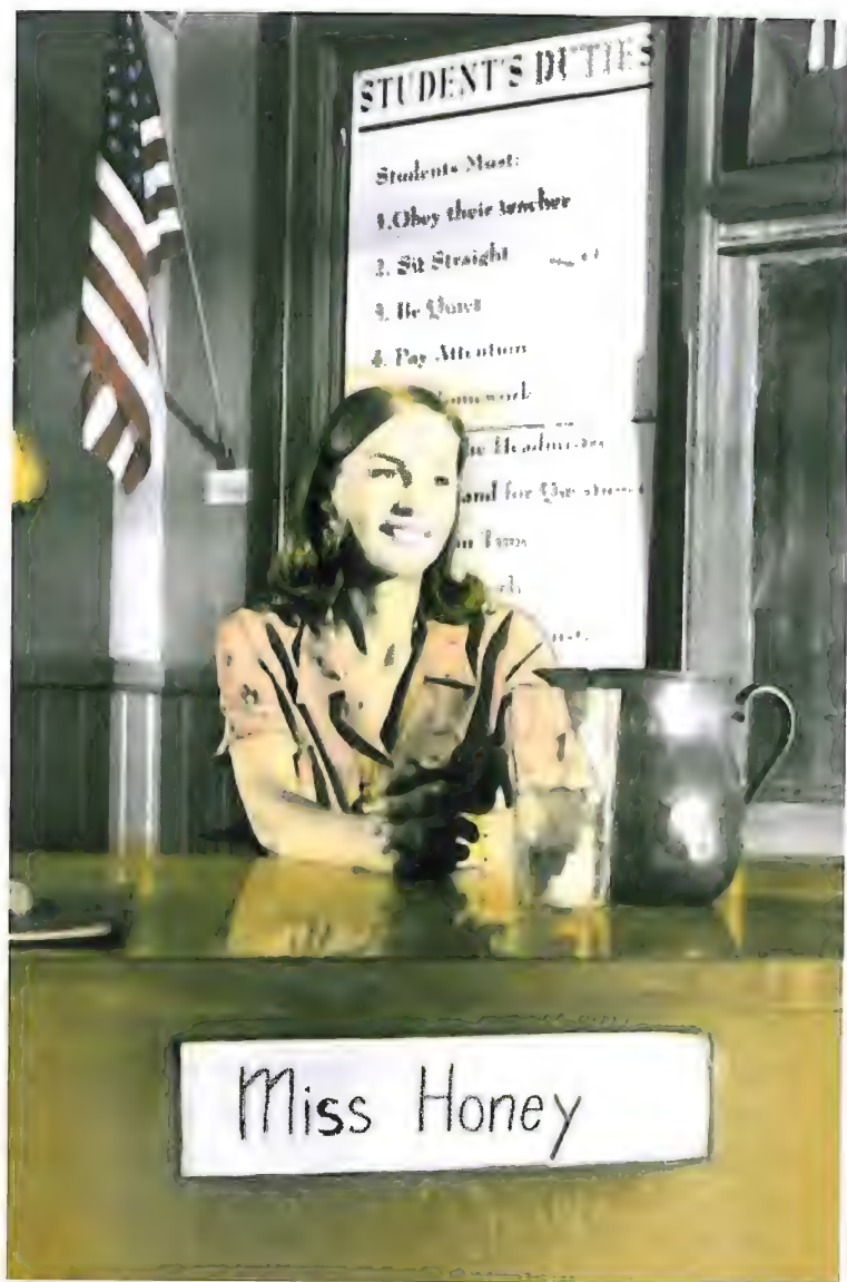
Their teacher was Miss Honey, and she was about twenty-three.